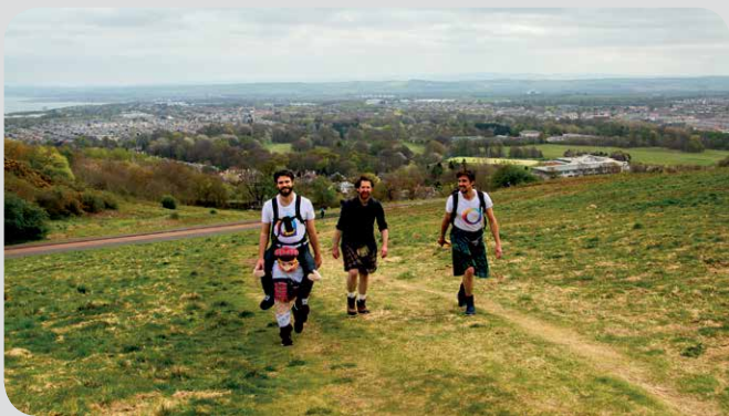
Some of our Kiltwalkers last year