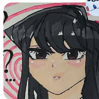
Some of Lucy's artwork

For more info about Moving Forward+, contact: moving.forward@nas.org.uk